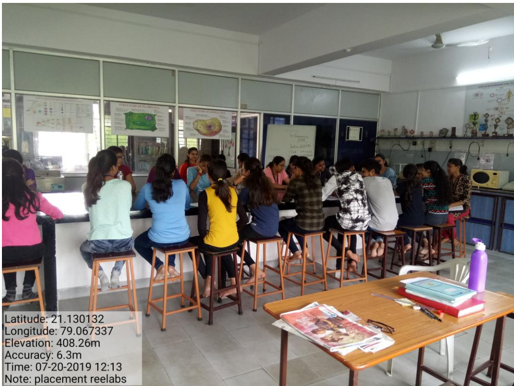
Latitude: 21.130132 Longitude: 79.067337 Elevation: 408.26m Accuracy: 6.3m Time: 07-20-2019 12:13 Note: placement reelabs